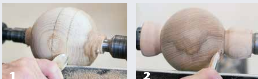
Direction of cut depends on grain orientation. At left, shear-cutting "downhill," from large diameter to small, on a sphere with the grain parallel to lathe bed. At right, shear-scraping "uphill," from small diameter to large, with sphere repositioned and its grain perpendicular to the lathe bed.