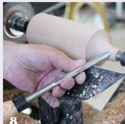
Cutting the left side of a cove illustrates the combination of the cutting arcs. Vertically, the tool handle moves upward; laterally, to the left; and rotationally, counterclockwise, with the flute twisting from 3 o'clock to 12 o'clock.

watching the tool handle while grinding a gouge with the assistance of a sharpening jig.